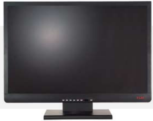
IMC-22LT 22" Monitor

The professional quality LT Series of LCD monitors are specifically designed for CCTV applications and come with 2 BNC outputs and 2 BNC inputs, VGA, 2 RCA, HDMI and PC Audio inputs. Display modes include Video 1, Video 2, PC and HDMI. The multi language OSD controls include Picture Mode, Contrast, Brightness, Colour Tint, Sharpness, Colour Temperature and DNR.